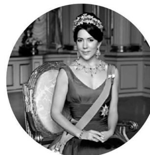
Mary, Crown Princess of Denmark.