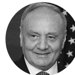
Nicolae Timofti, Former President of Republic of Moldova.

"Thank you very much for a great visit to Castel MIMI. We are looking forward coming back!"