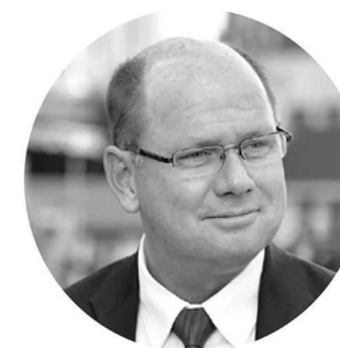
Urban Christian Ahlin, Former Speaker of the Swedish Parliament.

"Thank you very much for a great visit to Castel MIMI. We are looking forward coming back!"