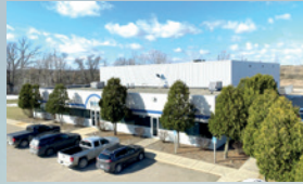
BBG North America LP