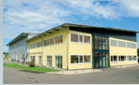
BBG GmbH & Co. KG