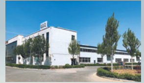
BBG Asia Ltd.