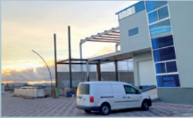
BBG Machines Tools Service Mexico S. De R.L. de C.V.