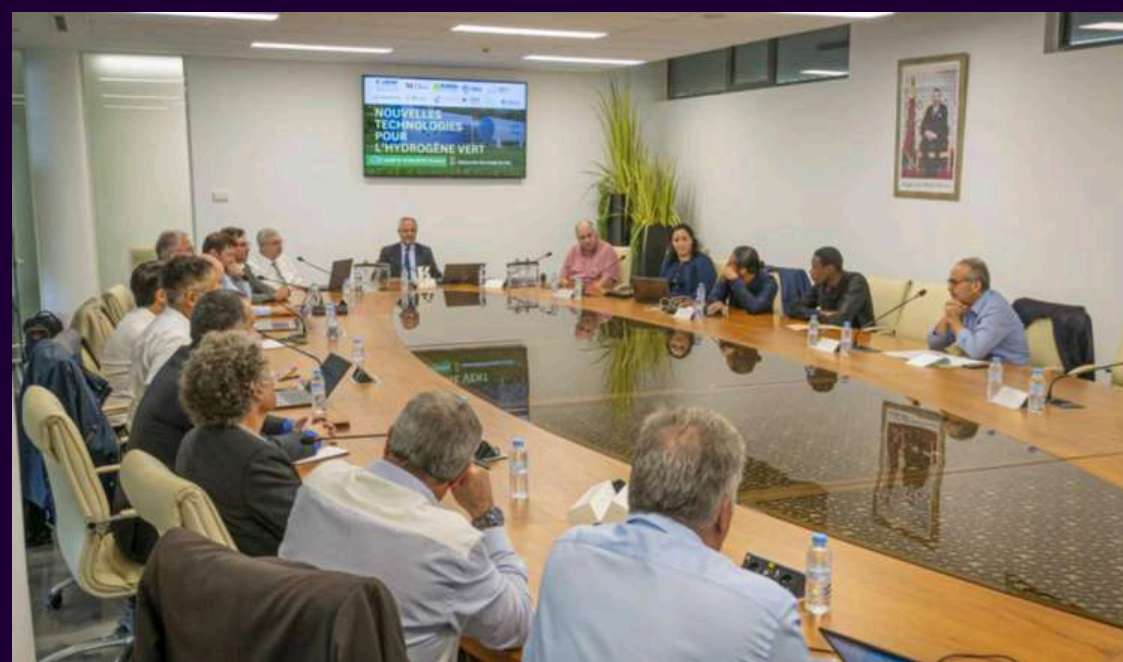
FES SMART FACTORY