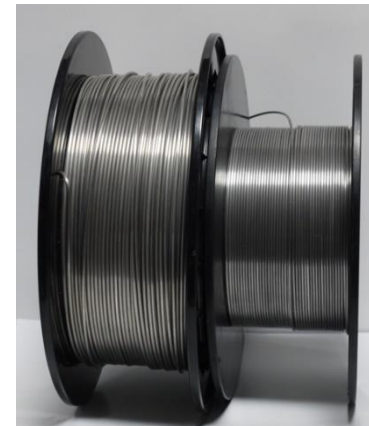
Cold drawn precision magnesium alloy wire \phi 0.8 - \phi 4.0 mm

Manufacture or R&D organization a stent, implant.