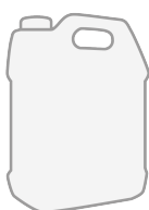
PLASTIC JERRYCAN OF 5

Some packages may not be available. Contact our sales department.