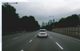
Hyper-Real Simulation Data