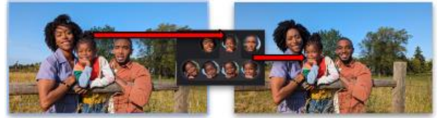
Intriguing properties of synthetic images: from generative adversarial networks to diffusion models