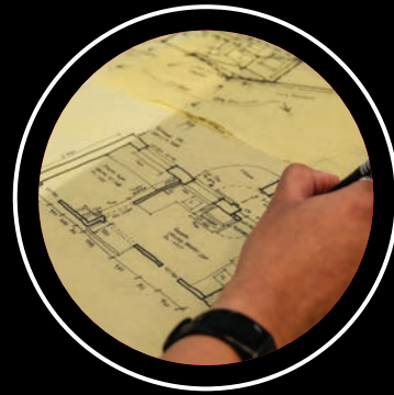
ARCHITECTURAL DRAWINGS AND FULL PLANNING APPLICATION PROCESS