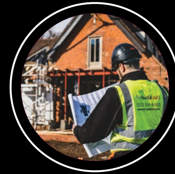
THE BUILD AND FINISHES