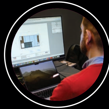
INTERNAL DESIGN, LAYOUT, AND SPACE ALLOCATION