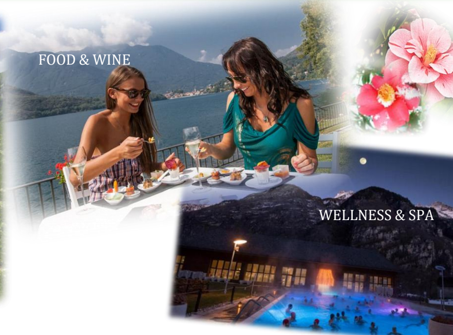
FOOD & WINE