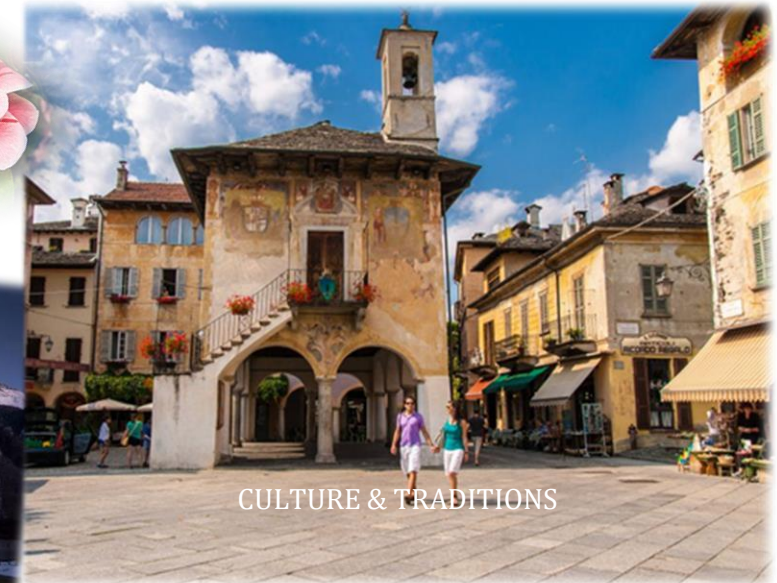
CULTURE & TRADITIONS