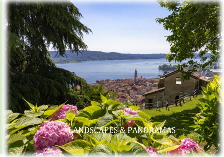
LANDSCAPES & PANORAMAS

for the most authentic Stay in Piemonte!