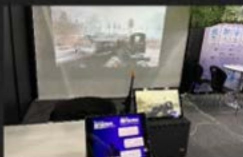
Korea Metaverse Expo