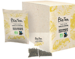
Black Tea with vanilla & caramel