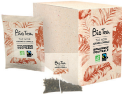
Black Tea with citrus fruits & cinnamon