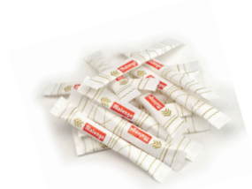
White sugar sachets