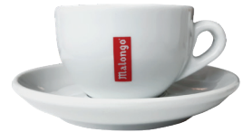
Barista Type Cups for espresso and tea