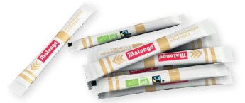
Organic and Fair trade brown sugar sachets