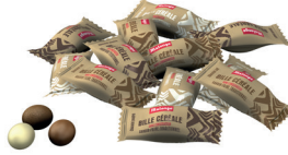
Cereal ball mix