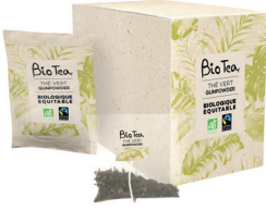
Gunpowder Green Tea