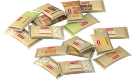
Sable mix: Mix biscuits Autumn/Winter Spring/Summer