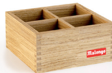
Oak sugar holder