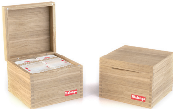
Coffee oak case Box of 20 coffee pods