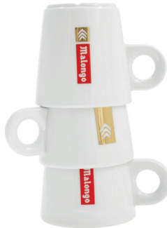
Stackable Cups for coffee, tea and breakfast