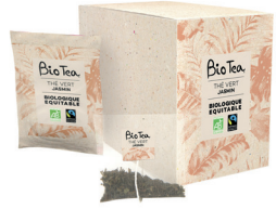
Jasmin Green Tea