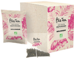
Red fruits herbal tea