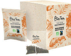
English Breakfast Black Tea