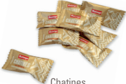
Chatines (almond covered with a fine layer of chocolate)

A selection of biscuits, chocolates and sweets to accompany your coffee or tea time.