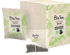
Mint Green Tea