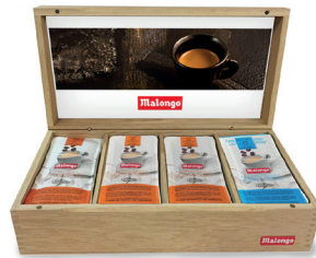
Coffee oak case with 4 compartments