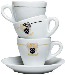
Conical Cups for espresso and tea

These cups made of porcelain have been specially designed to allow the cream to realise its full potential.