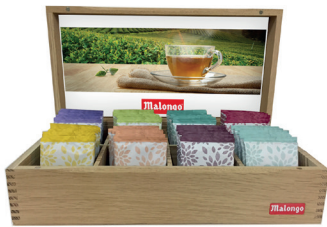
Bio tea oak case 8 compartments