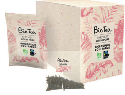
Green Tea with Litchi Pear