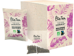
Darjeeling Black Tea PG1* *Protection of geographical indications