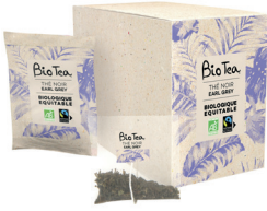
Earl Grey Black Tea