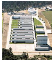
Colab4Food @ INIAV – Site Vairão

Research & Innovation non-profit association – Portugal