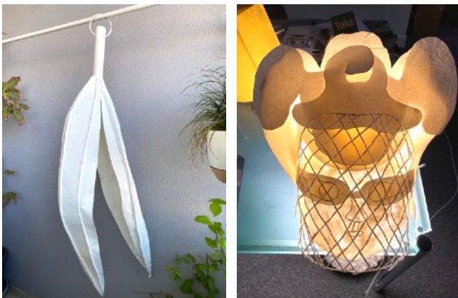
Magic Pulp ©