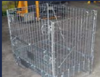
Wine crate Bourgogne