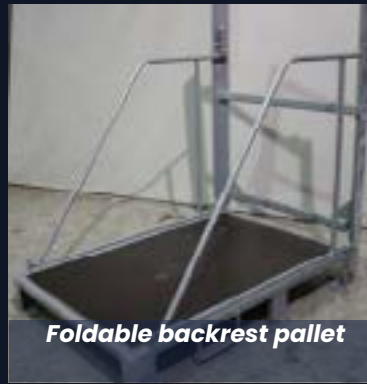
Foldable backrest pallet