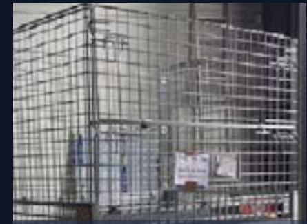
1.5 m³ crushed plastic box