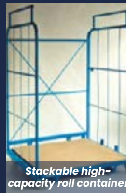
Stackable high-capacity roll container