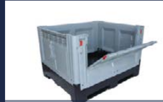
Foldable plastic containers