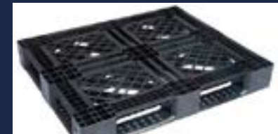
Perforated plastic pallet