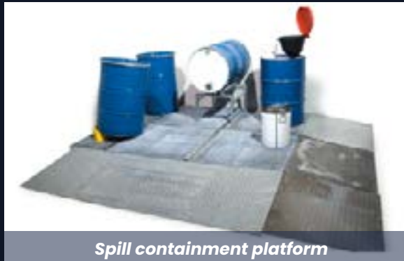
Spill containment platform