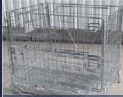
Wine crate Bordeaux