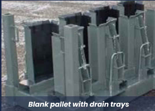
Blank pallet with drain trays