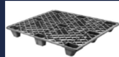
Lightweight plastic pallet