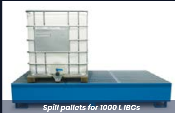
Spill pallets for 1000 L IBCs