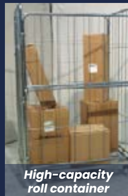
High-capacity roll container