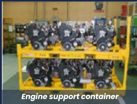
Engine support container