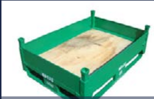
Sheet metal container 00133