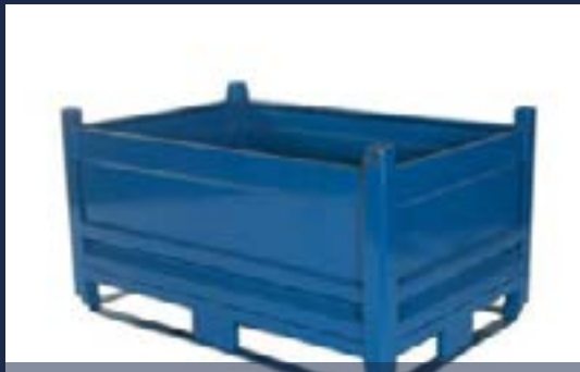
Sheet metal container 00082