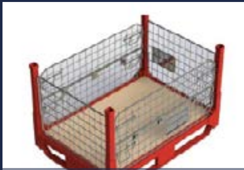
Mesh container 00081