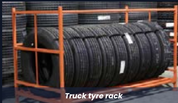
Truck tyre rack