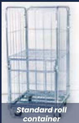
Standard roll container