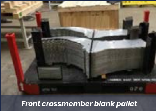
Front crossmember blank pallet