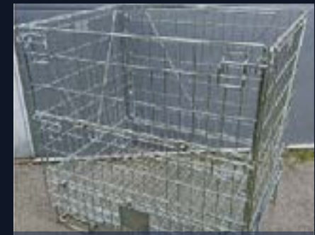
1 m³ WEEE box