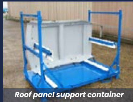
Roof panel support container