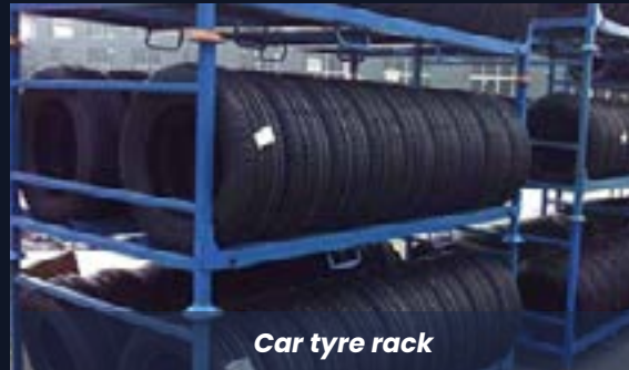
Car tyre rack