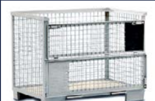
EUROPOOL pallet boxes