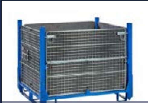
Intralogistic container 0770