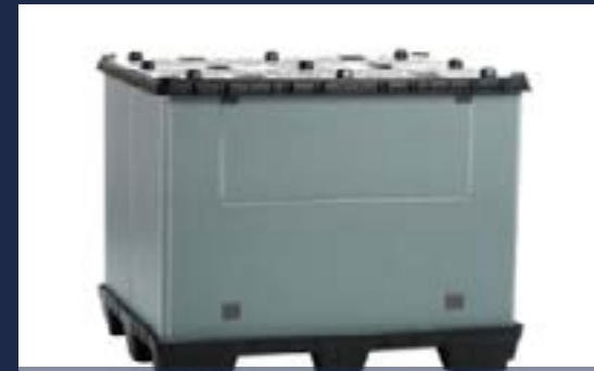
Plastic pallet box