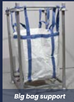
Big bag support