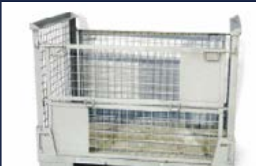
Foldable pallet box