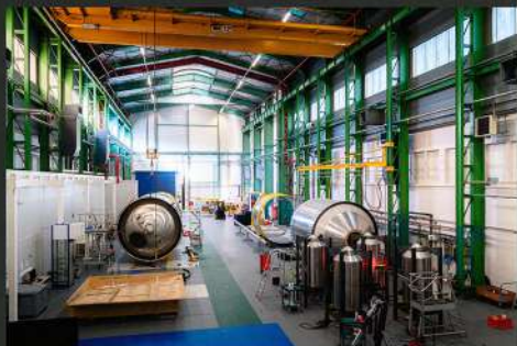
MaiaFactory - France, Vernon