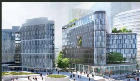
Offices - France, La Defense