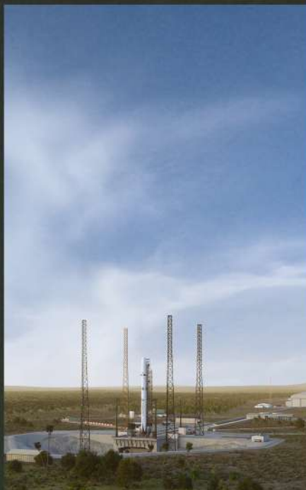
Launch pad - French Guiana, Kourou