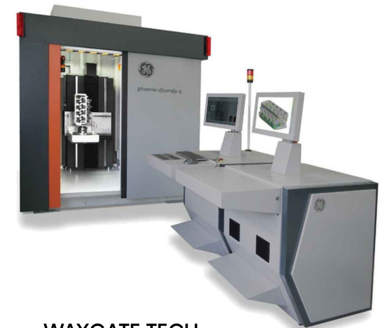
WAYGATE TECH. PHOENIX V|TOME|XC SCATTER|CORRECT/ HS