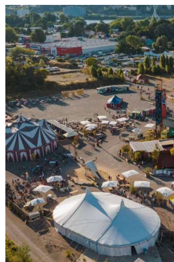
Transfert, Rezé, Pick Up Production