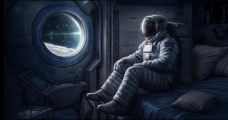
Isolation & Confinement