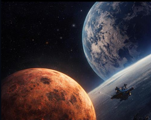
Distance from Earth