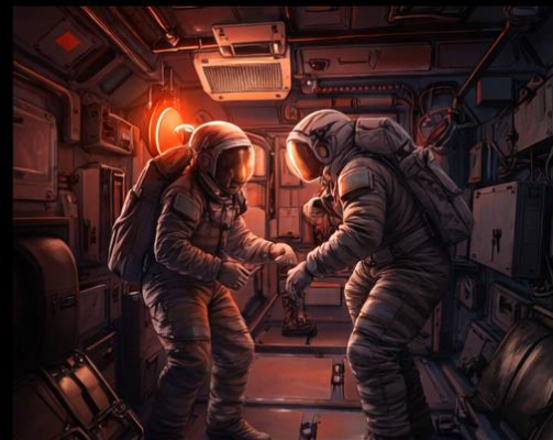
Hostile / Closed Environments