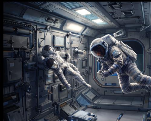
Gravity fields (microgravity)