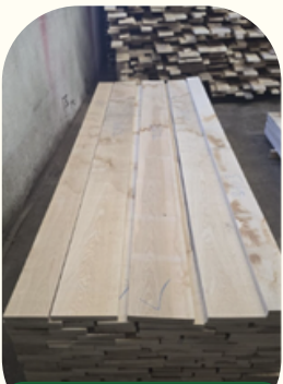
ASH SQ. EDGED