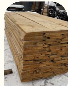
OAK SQ. EDGED