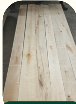
LIME SQ. EDGED