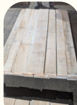
POPLAR SQ. EDGED