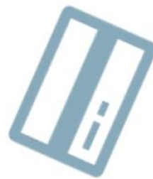
Pay by Use