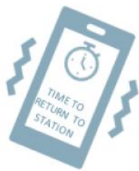
User Unique SMS Code