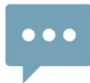
UX user screen