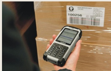
Barcode Data Collectors