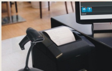
Barcode Printer & Scanner

Digitalwares is the subsidiary of the digitalgroup that imports and supply technology hardware products in Pakistan markets.