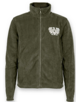
POLAR JACKET 100% POLYESTER