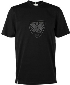
MEN'S TSHIRT 100% COTTON

YOUR, GLOBAL & SUSTAINABLE TEXTILE PARTNER