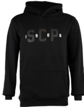
HOODIE 80% COTTON 20% POLYESTER