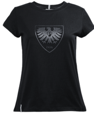
WOMEN'S TSHIRT 100% COTTON