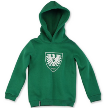
CHILD HOODIE 80% COTTON 20% POLYESTER