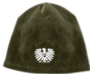
POLAR BEANIE 100% POLYESTER