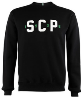
SWEATSHIRT 80% COTTON 20% POLYESTER