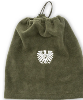
POLAR NECK WARMER 100% POLYESTER