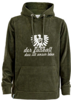
POLAR HOODIE 100% POLYESTER