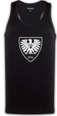
MEN'S TANK TOP 100% COTTON