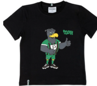
CHILD TSHIRT 100% COTTON