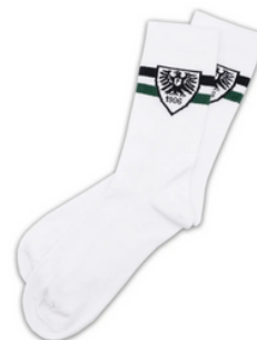
SPORT SOCK COTTON-POLYESTER