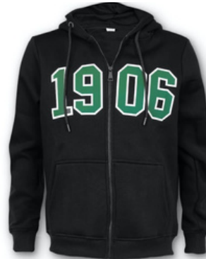
ZIPPED HOODIE 80% COTTON 20% POLYESTER