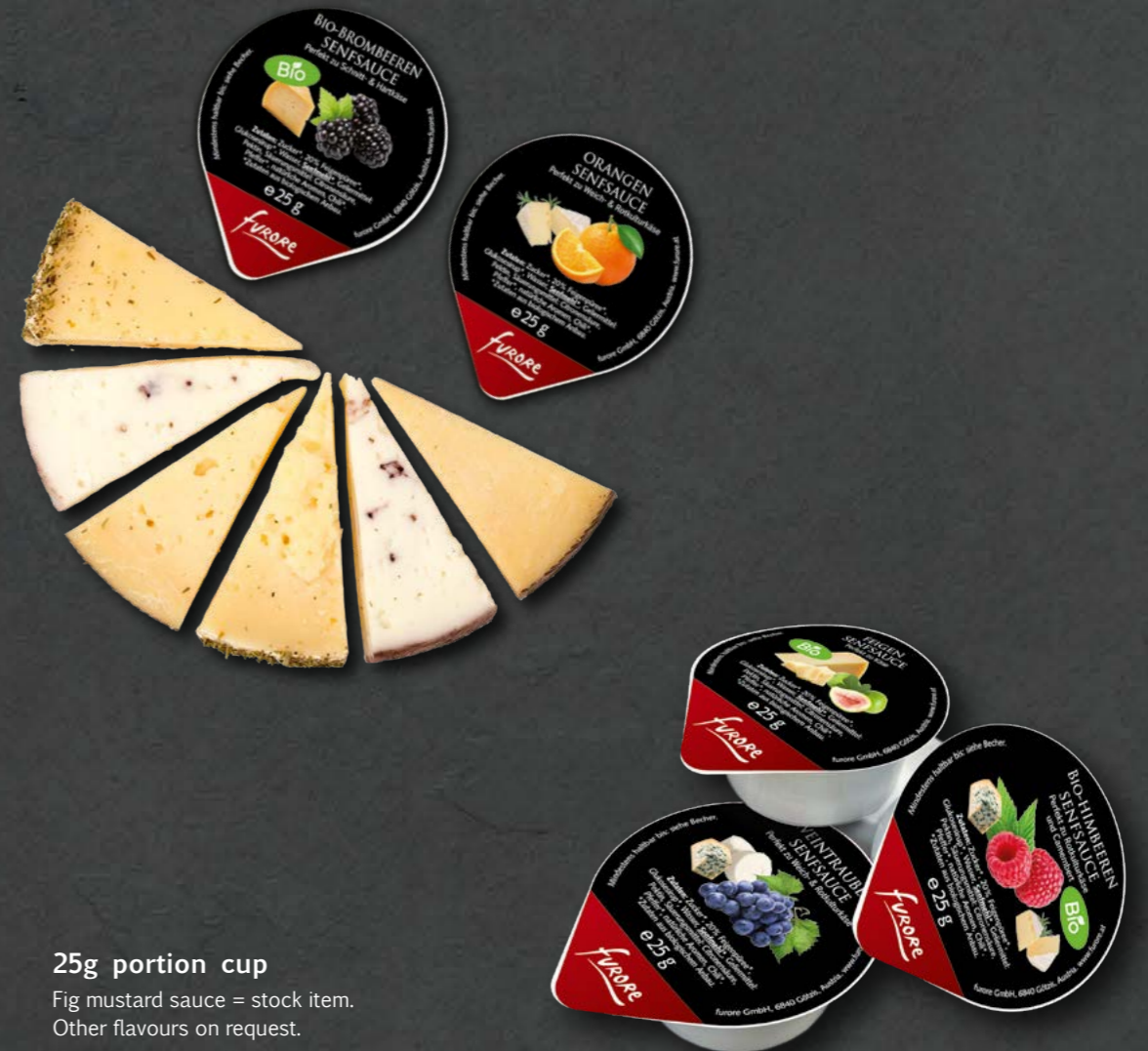
25g portion cup Fig mustard sauce = stock item. Other flavours on request.