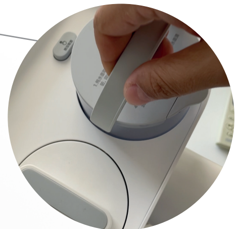
Removable Pure Water Tank

EAN13: pending Unit size: 30 x 22 x 35 cm Unit Box Size: 39,7 x 27,7 x 43,5 cm Unit Weight: pending 40 HQ container: pending