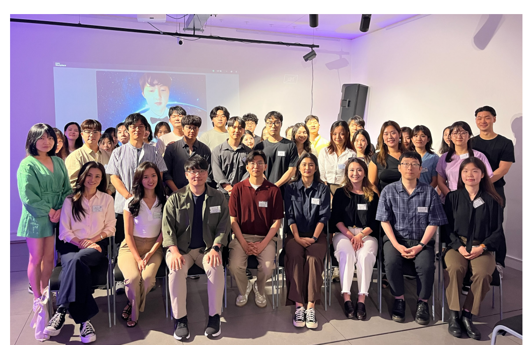
25.06.28 Hybrid Career Seminar (110 attendees)