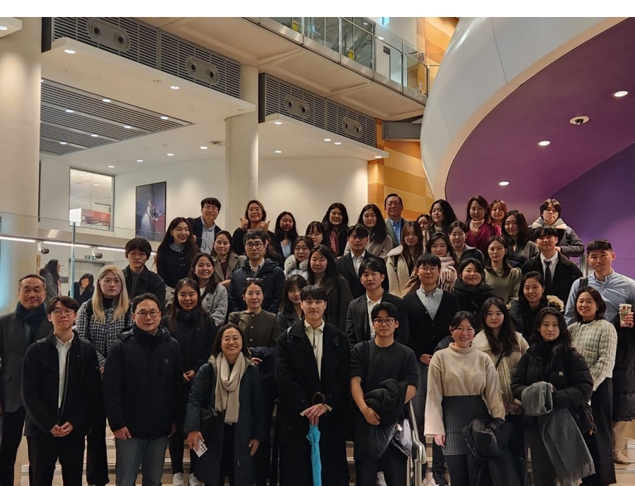
24.11.23 London Networking Mixer (112 attendees)

We are open to many fields including life sciences, biotechnology, medical devices, business development, intellectual property, and health sciences. We welcome anyone from various backgrounds including academic, NHS, government, and industry.