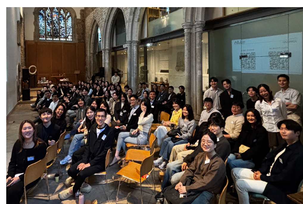
25.04.05 London KULSA Symposium (80 attendees)