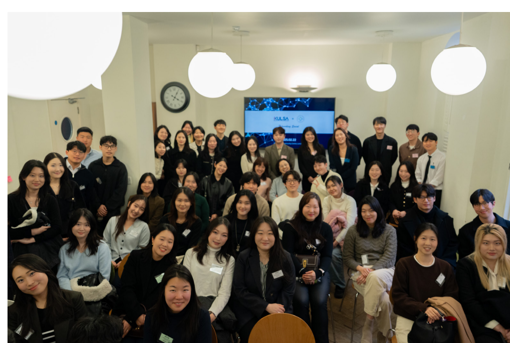
25.02.22 London KULSA & KUPHARM Networking (65 attendees)