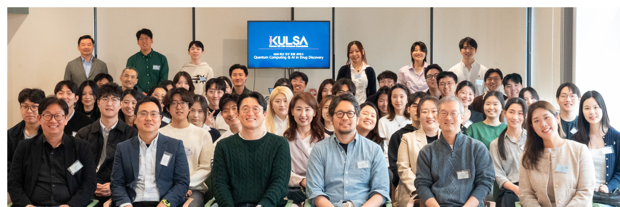
25.06.07 London Research Seminar (58 attendees)