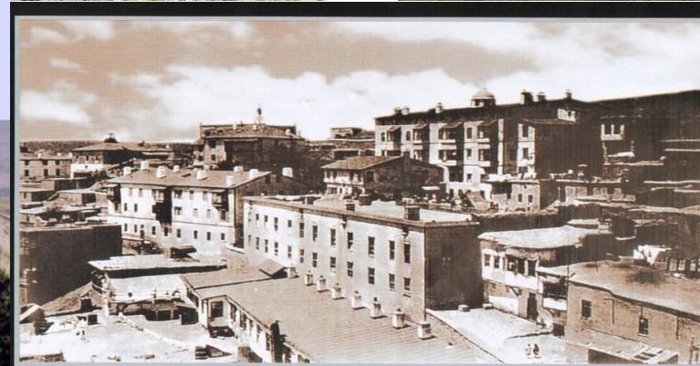
1800'ü yılların sonuna doğru Harput Amerikan Okulları kız bölümü (Fırat Koleji)