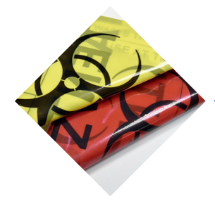
TESABAG Autoclavable biohazardous waste bags