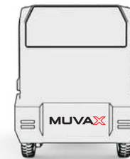
Height (mm) 1500