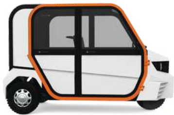
Length (mm) 2800