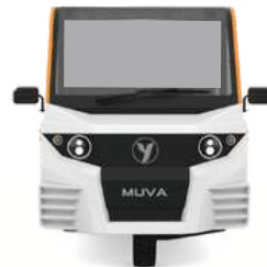
Width (mm) 1400