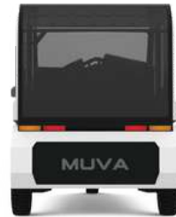
Height (mm) 1500