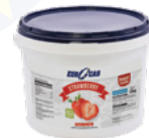
Strawberry Fruit Filling 50%

12 kg plastic bucket 55 plastic bucket/palet Weight: 660 kg