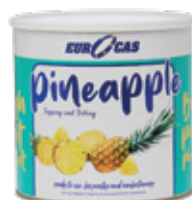
Pineapple Topping & Filling

2,6 kg / can 216 cans/palet Weight: 561,6 kg