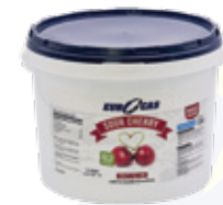
Sourcherry Fruit Filling 50%

6 kg plastic bucket 100 plastic bucket/palet Weight: 600 kg