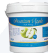
Premium Apple Fruit Filling 90%

11 kg plastic bucket 65 plastic bucket/palet Weight: 715 kg