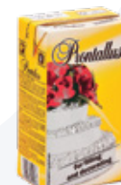
Tetra Pak brick of 1l

12 liters/carton box 72 carton boxes/pallet Weight: 864 kg