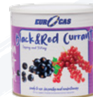
Black & Red Currant Topping & Filling

2,6 kg / can 216 cans/palet Weight: 561,6 kg