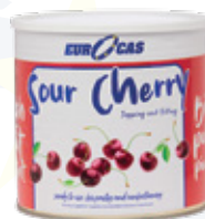
Sourcherry Topping & Filling

that can be quickly filled with various types of Eurocas creams and fruit fillings, resulting in a wide range of filled tarts,