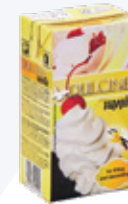
Tetra Pak brick of 1l

12 liters/carton box 72 carton boxes/pallet Weight: 864 kg