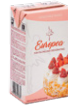
Tetra Pak brick of 1l

"Eurocas has a very extensive range of non dairy creams so it can cover all demands and tastes that your specific market might have."