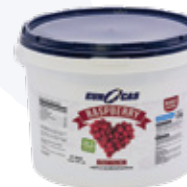
Raspberry Fruit Filling 50%

12 kg plastic bucket 55 plastic bucket/palet Weight: 660 kg