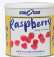
Raspberry Topping & Filling

2,6 kg / can 216 cans/palet Weight: 561,6 kg