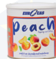
Peach Topping & Filling

2,6 kg / can 216 cans/palet Weight: 561,6 kg