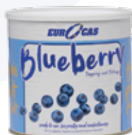
Blueberry Topping & Filling

2,6 kg / can 216 cans/palet Weight: 561,6 kg