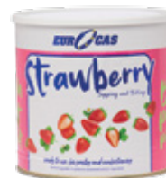
Strawberry Topping & Filling

2,6 kg / can 216 cans/palet Weight: 561,6 kg