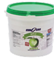
Apple Fruit Filling 85%

APPLE - CHERRY - APRICOT - STRAWBERRIES RASPBERRIES - BLACKCURRANT