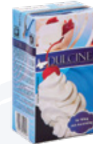
Tetra Pak brick of 1l

12 liters/carton box 72 carton boxes/pallet Weight: 864 kg