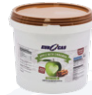
Apple with cinnamon Fruit Filling 85%

11 kg plastic bucket 65 plastic bucket/palet Weight: 715 kg