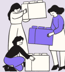
Session 7: Escape room