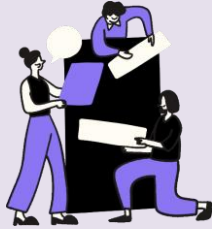
Session 6: $ 2 Game