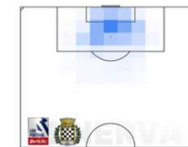
Sufficient coverage of space with resources per extensive scenario simulation