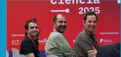
"A Minha Região – O teu portal autárquico" 1º lugar no Prémio Arquivo.pt 2025