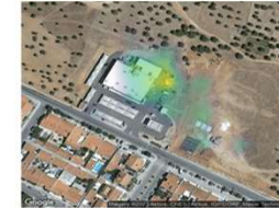
Identify landfills from satellite images