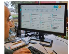
NLP on health records