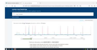
TellMeAStory: reconstruct timeline from disjointed narratives