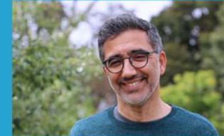
"About DeepSeek" Jornal Público: 20250128