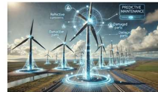
Online Explainable Predictive Maintenance