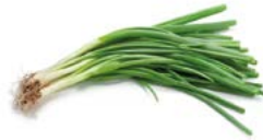
Spring onions processing