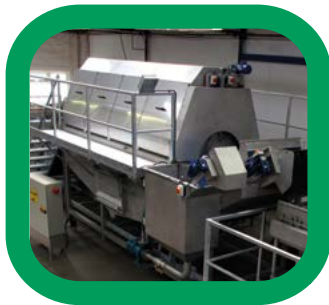
Washing and drying