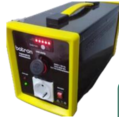
Lithium Based Power Station