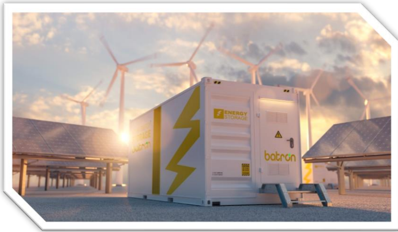
Future Storage System