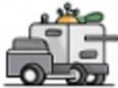
Delivery of Groceries, Food