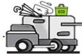
Daily Necessities such as Umbrella, Power bank, eco Bag