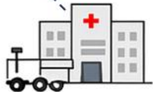
AED, First Aid

Multi-purpose Robots: Robots are modular, we can swap "tool pods" for different jobs or purpose.