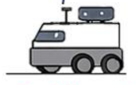
Basic Diagnostics & Repair Tool