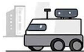
Patrol Mission at Night