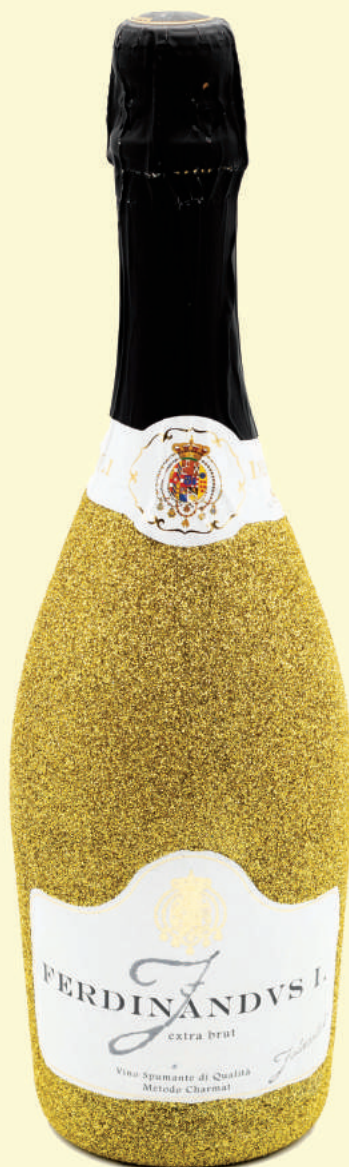
Hand-decorated Bottle covered with GOLD/SILVER Glitter