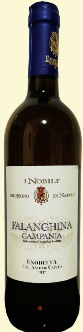
Falanghina Campania IGP