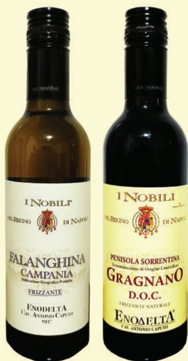
Mini-bar - Hotel Line Screw Cap