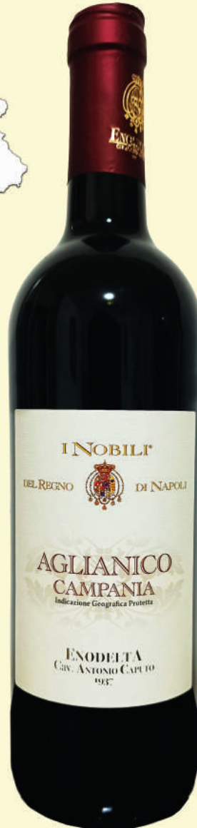
Aglianico Campania IGP