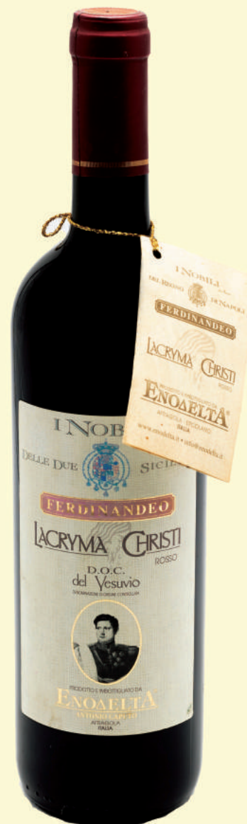
FERDINANDEO Lacryma Christi Vesuvio D.O.C. rosso Millesimato *produced only in particular vintages