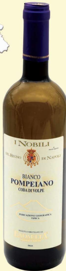
Bianco Pompeiano Coda di Volpe Pompeiano IGP