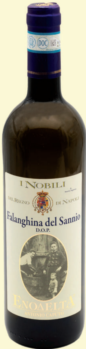
Falanghina del Sannio DOP