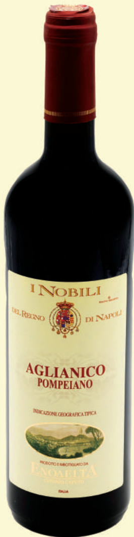
Aglianico Pompeiano IGP