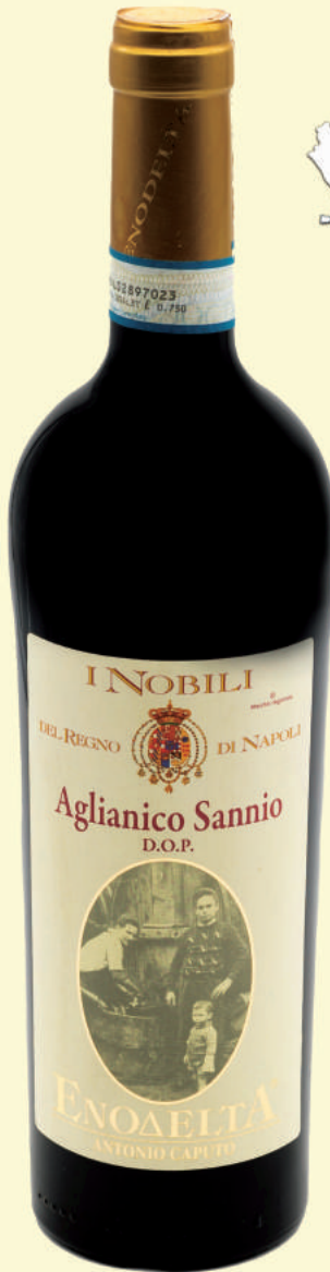
Aglianico Sannio DOP