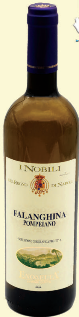
Falanghina Pompeiano IGP