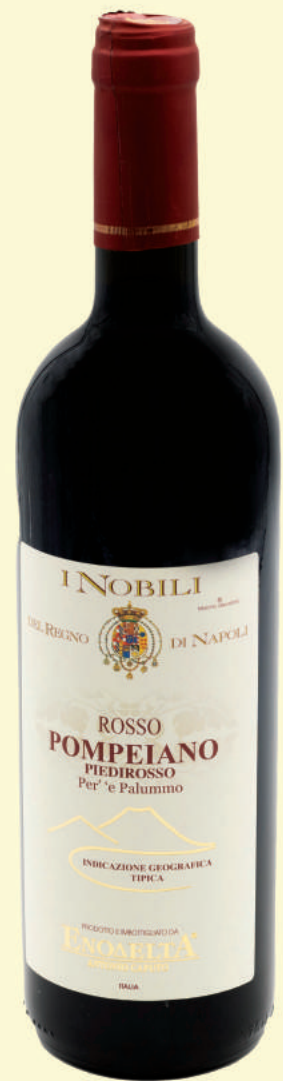
Rosso Pompeiano "Per' e Palummo" Piedirosso Pompeiano IGP