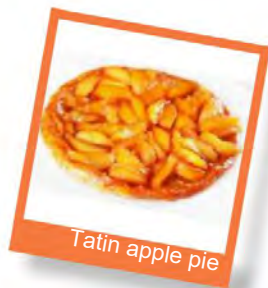
Tatin apple pie