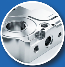
MACHINED PARTS & ASSEMBLIES

LR PURE integrates high-purity solutions for demanding industries.