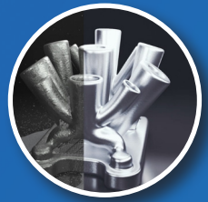
HIRTISATION® OF 3D-PRINTED PARTS