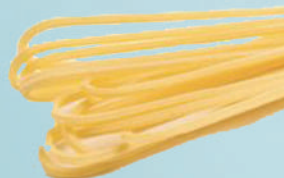
TAGLIOLINI Senatore Cappelli