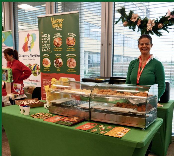
Photos: Happy Hour Foods Stall at Farmers Market and Corporate Events. Meet us at St. Anne's Park on Saturday 10am-4pm and Herbert Park on Sunday 11am-4pm