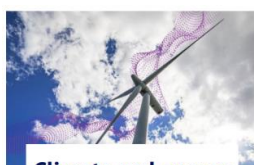
Climate and energy