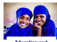
Education and research