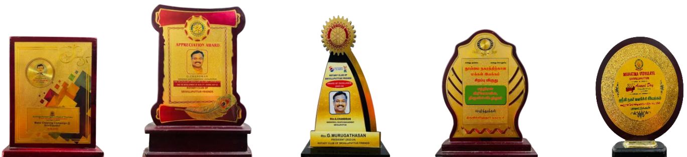
Greenowill Waste Management

In 2021, Greenowill evolved into a dynamic social enterprise, introducing downcycling processes for multi-layered plastics and managing waste across 23 wards. This transition solidified our commitment to environmental excellence and community health.