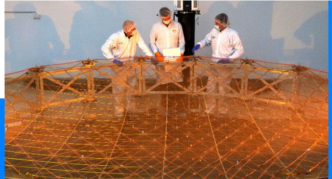
5 m large deployable mesh/network with HPtEX-USM-mesh under surface accuracy testing