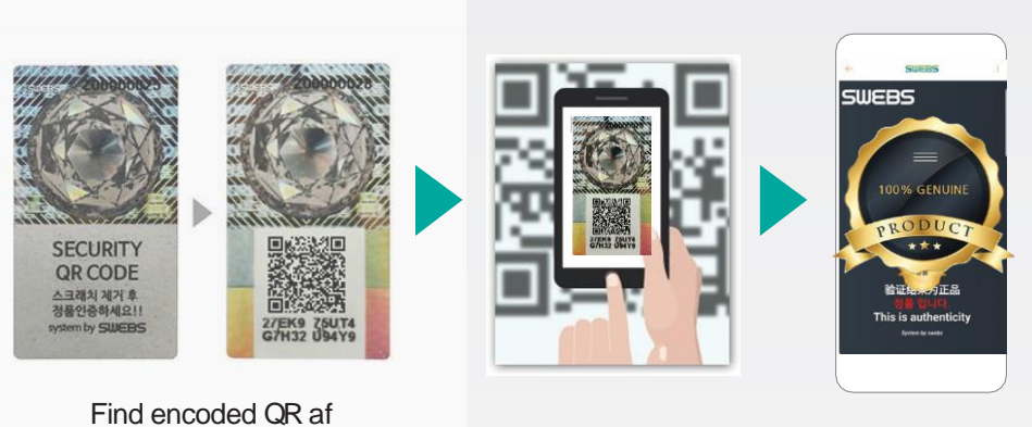
Find encoded QR af ter removing Scratch