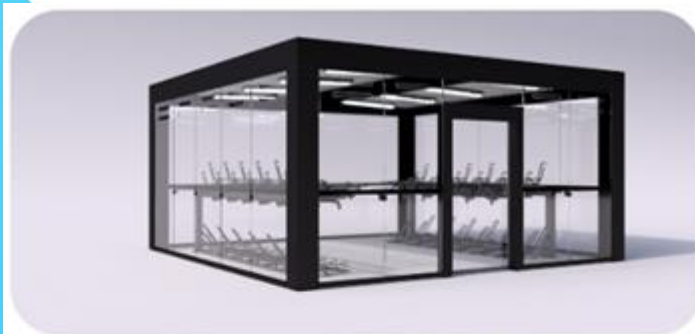
WEELO HUB 40

The whole structure, the covering, the infills, the automatic access door and the bike racks can be disassembled and reused: after removing the glass plates, the roofing and the door, all bolts are removed, including those for ground fixing, and the disassembled structure can be put away to be reused when needed.