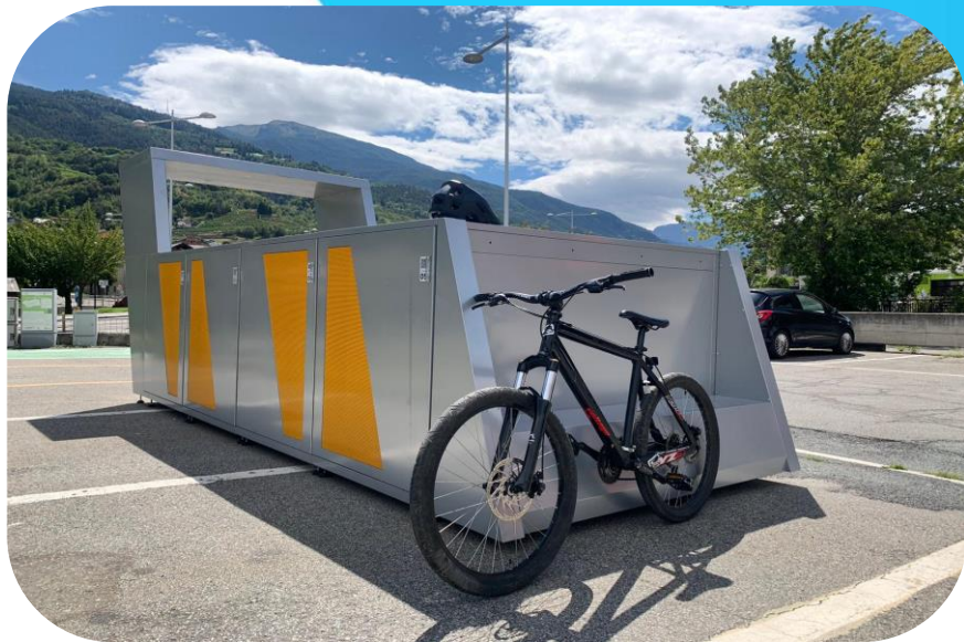
WEELO BOX AOSTA