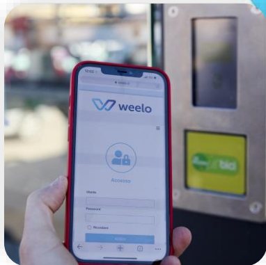
Smart access with the Weelo platform.