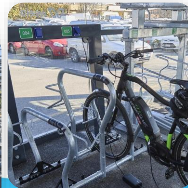
Plug for e-bike recharge.