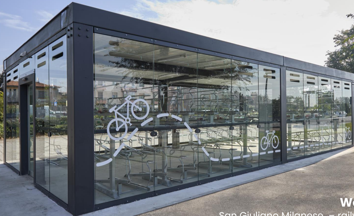
Weelo HUB San Giuliano Milanese – railway station