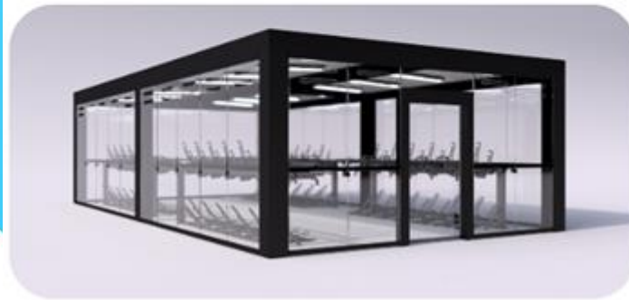
WEELO HUB 80