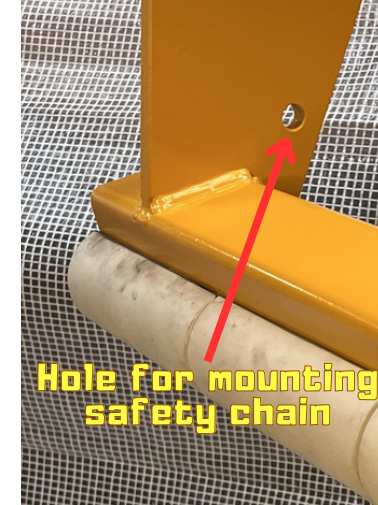
Hole for mounting safety chain