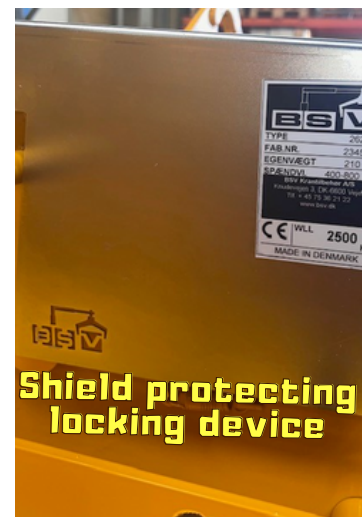
Shield protecting locking device