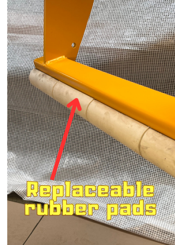
Replaceable rubber pads