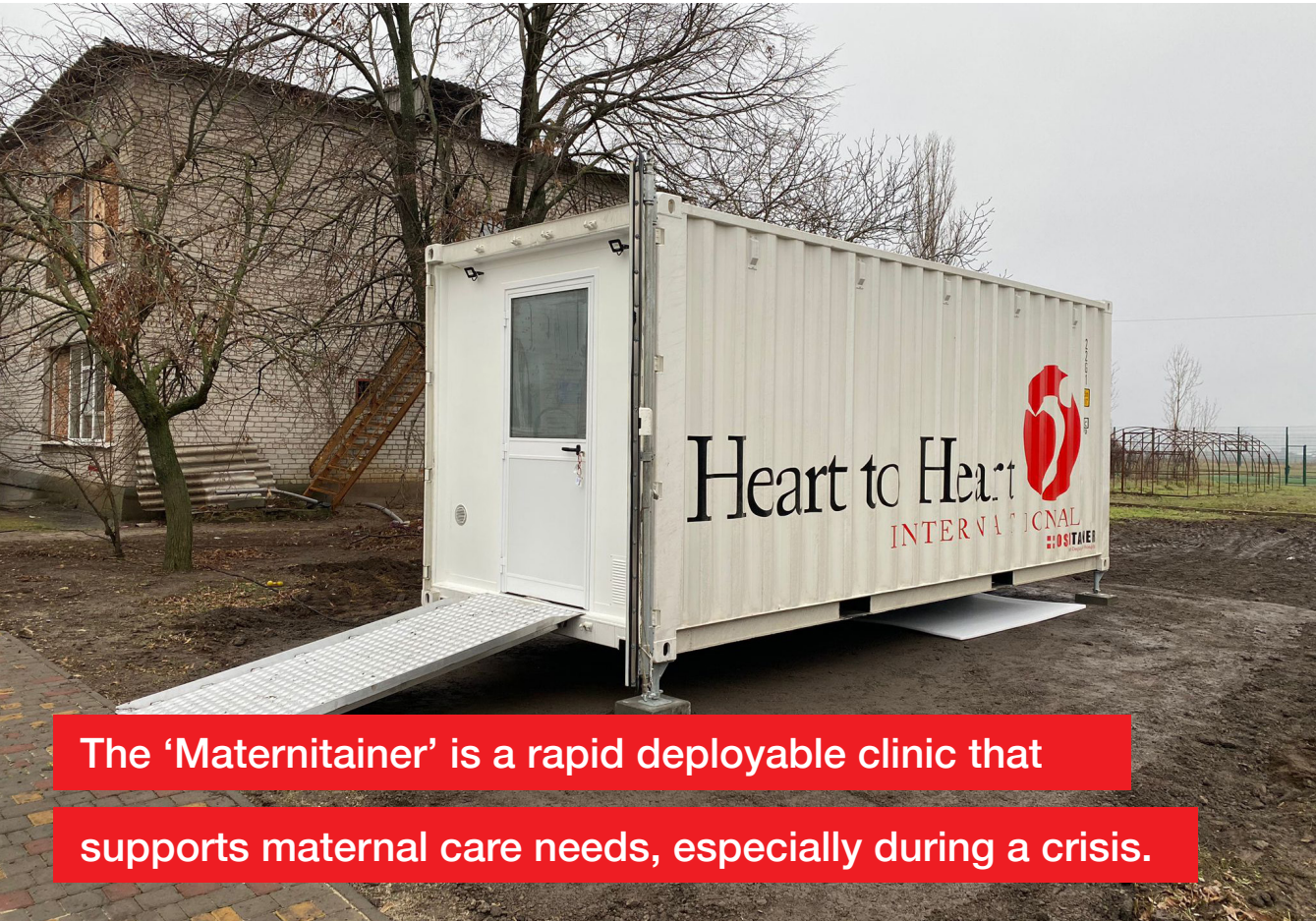
The ‘Maternitainer’ is a rapid deployable clinic that supports maternal care needs, especially during a crisis.

Since the war in Ukraine began, Ukrainian mothers have been forced to give birth in dangerous conditions, risking their lives as they flee violence. Hospitainer has provided a ‘Maternitainer’ for Heart to Heart International to temporarily cover emergency obstetric care needs of Ukrainian women.