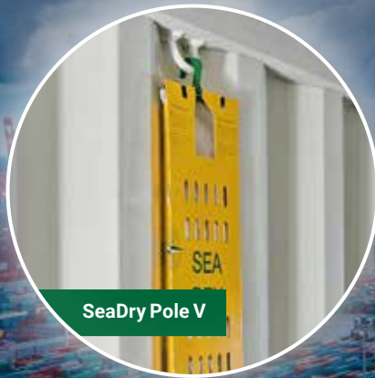
SeaDry Pole V