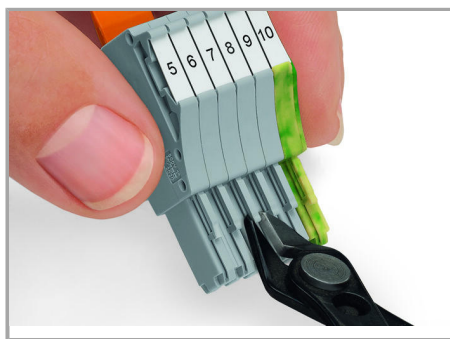
Coding a female plug: remove coding finger using a suitable tool.