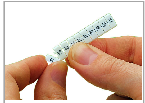
Separating an individual marker from the WMB marker strip – for larger terminal blocks.