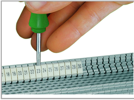
Snapping a WMB marker strip into the marker slot of the double marker carrier.